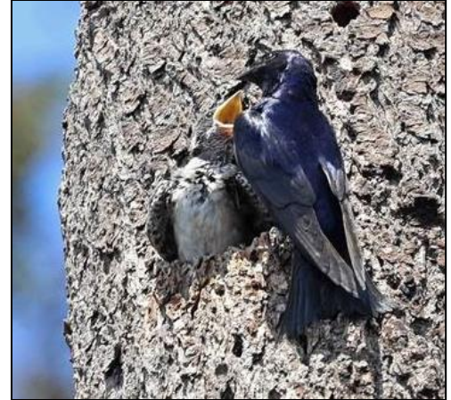
A Purple Martin feeding a nestling at a new breeding location found by atlasers in 2021.

These rare and poorly known species include Purple Martin, Black Swift, Vaux's Swift, which are all California Bird Species of Special Concern.